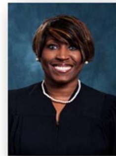
The Honorable Patrice Moore Judge of the 6th Judicial Circuit